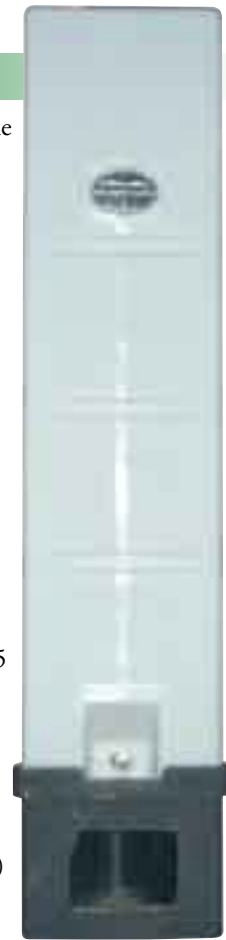
SL-25STAND (sold separately)