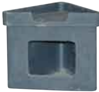
SL-25STAND (sold separately)