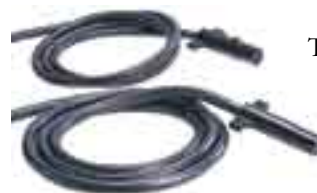
TC61-104 & TC61-108

White . . . . .Ground Blue/Black . . . . .Electric Brake Green . . . . .Right, Stop & Turn Red . . . . .Auxiliary Brown . . . . .Tail & License Yellow . . . . .Left, Stop & Turn