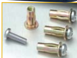
MWCFKM (Mounting Kit-Metal.)