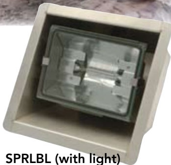
SPRLBL (with light)