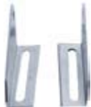
400L & 400R

Universal Roller Brackets will accommodate any size roller length. The One-Piece Bracket is for 12" rollers only. Both Brackets feature a five inch slot, which allows vertical adjustment for stabilizing boat on trailer, and zinc coating to protect against corrosion. Both use a 5/8" Roller Shaft (#135) and Pal Nuts (#1310).